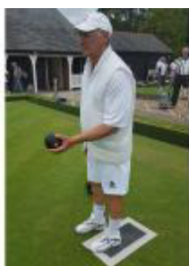
White Tailored BE Shorts available