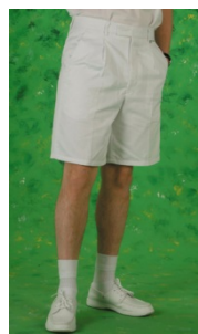
Tailored shorts - Various suppliers